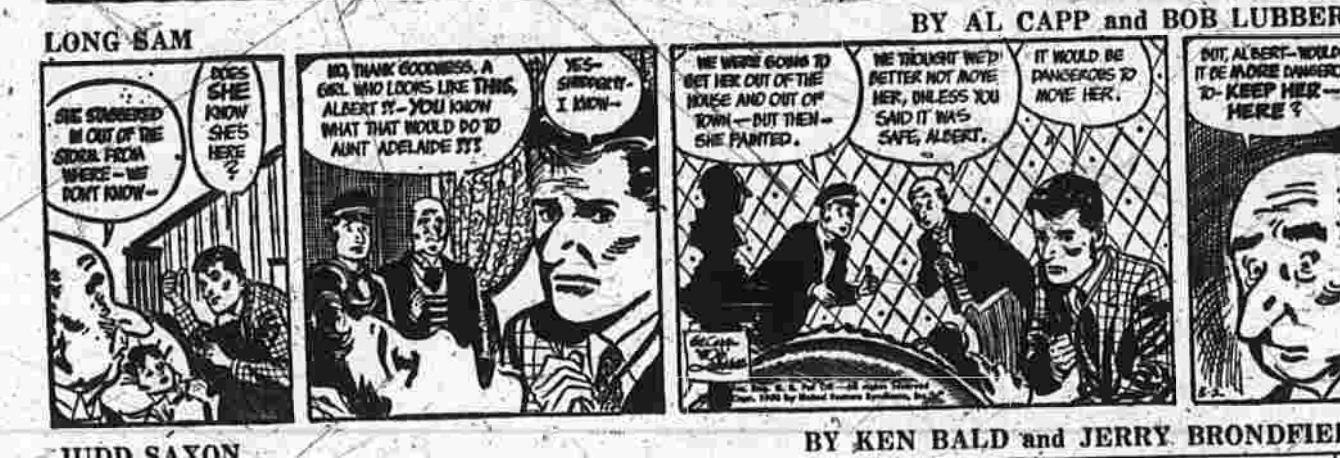
BY AL CAPP AND BOB LUBBERS