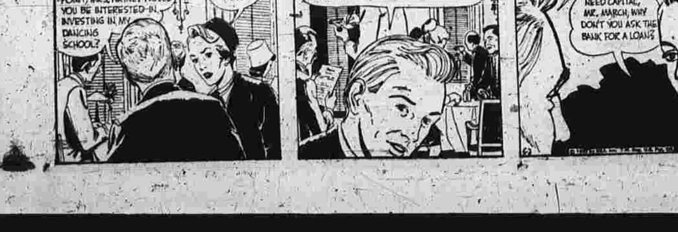
BY WILSON SCRIGGS