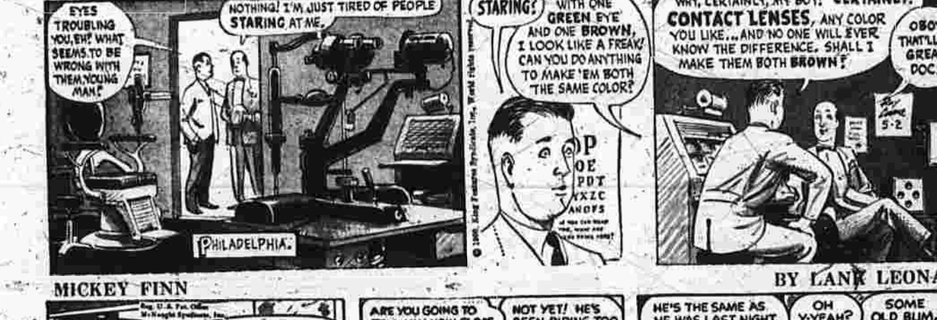
BY ROY CRANE